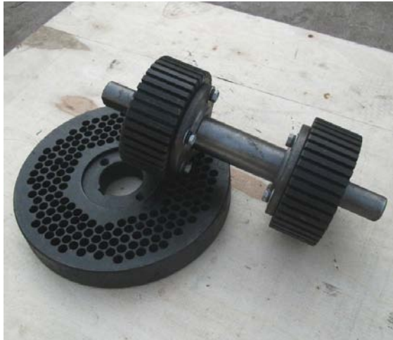
Flat die and roller of small flat die pellet machine

Supply carbon steel flat die for wood pellet, stainless steel flat die for animal feed pellets.