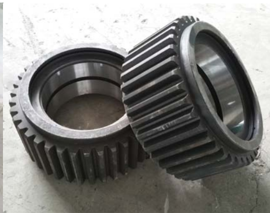
Roller shell of flat die pellet mill