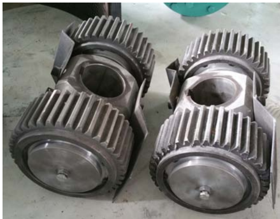
Roller assembly of flat die pellet mill